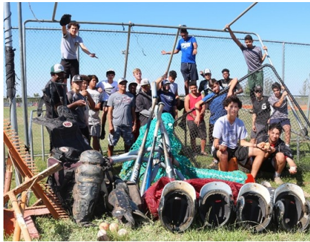
Everglades High School Baseball Team